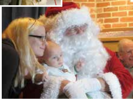
Above: An unforgettable moment at the Dare House party.