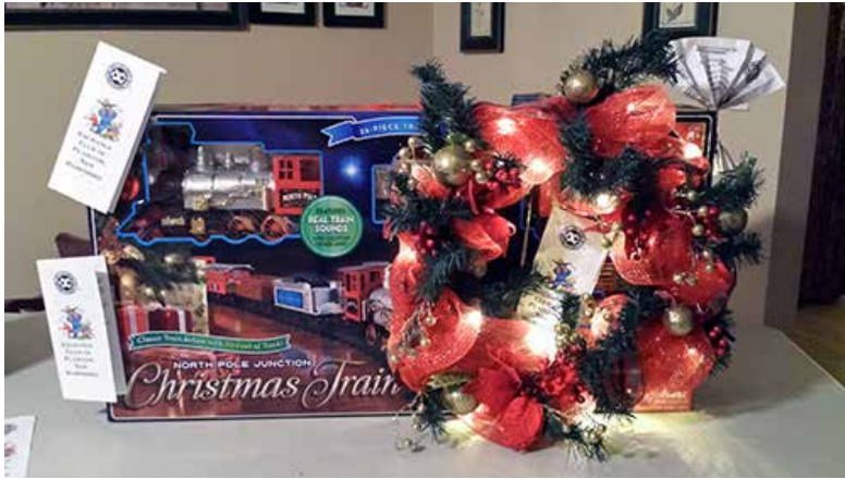
Plaistow XC participated in the Plaistow Festival of Trees held at City Hall to raise money for projects in Plaistow.