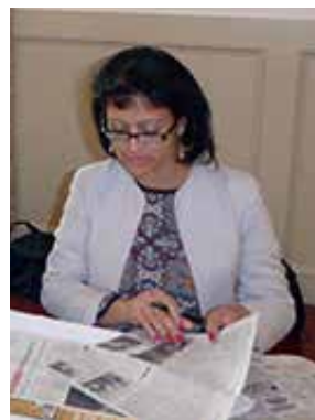
Yadira Betances of the Eagle Tribune