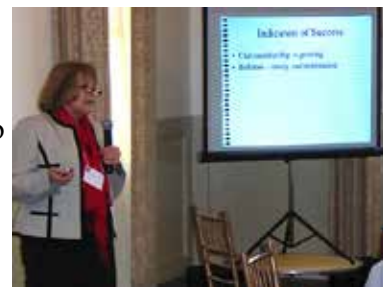
Wetherbee Excel members